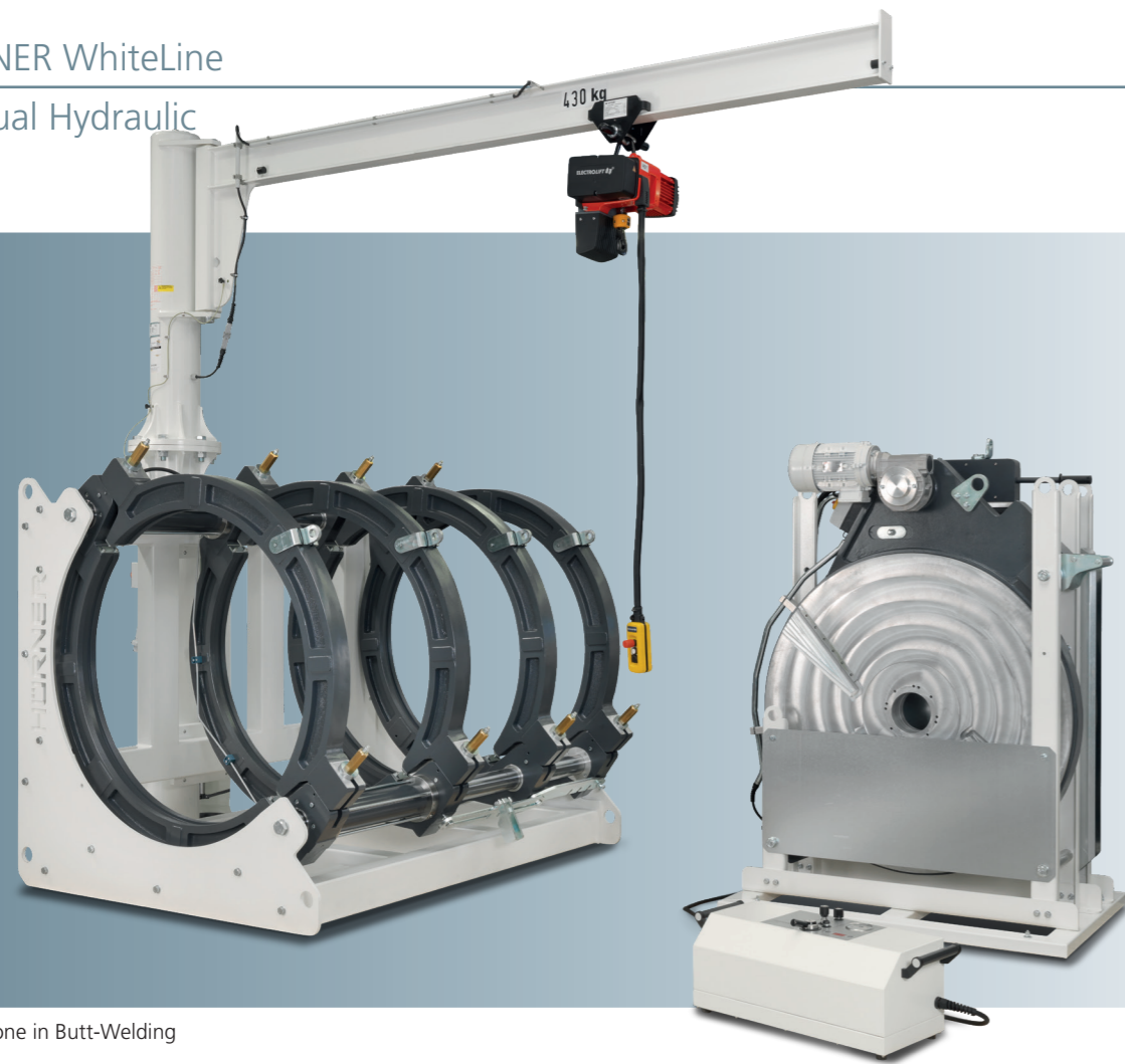
Stand-alone in Butt-Welding